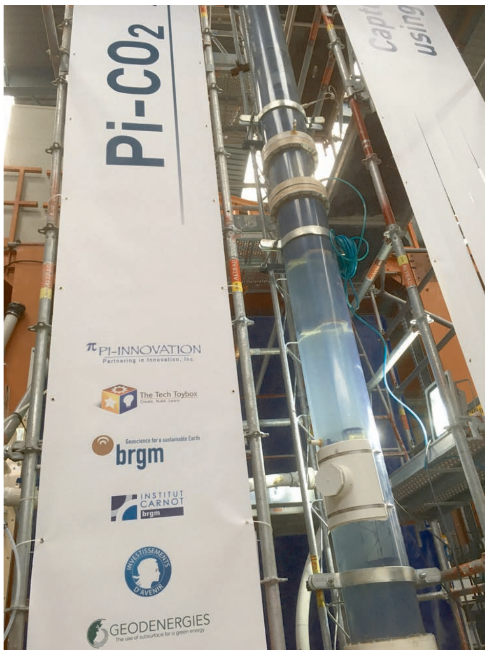
Figure 3 - Pi-CO2 Prototype in BRGM Laboratory

The system was tested sequentially – first with one stage, then two (observing flow and bubble dynamics in the transfer between stages) and finally transfer and continuous circulation between three stages. A customized automated data collection and control system provided parameter measurements and data compilation.